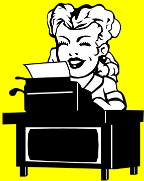
From the Secretary's Desk